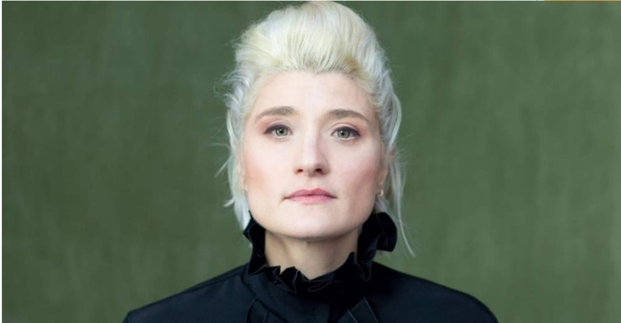
HEATHER CHRISTIAN for The World is Round