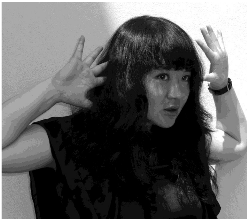
In Our Daughter's Eyes Du Yun