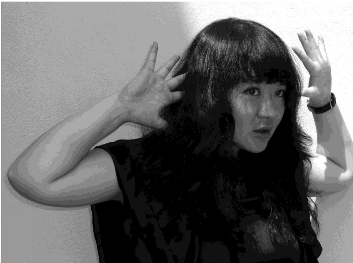
DU YUN 2017 Pulitzer Prize for “Angel’s Bone”