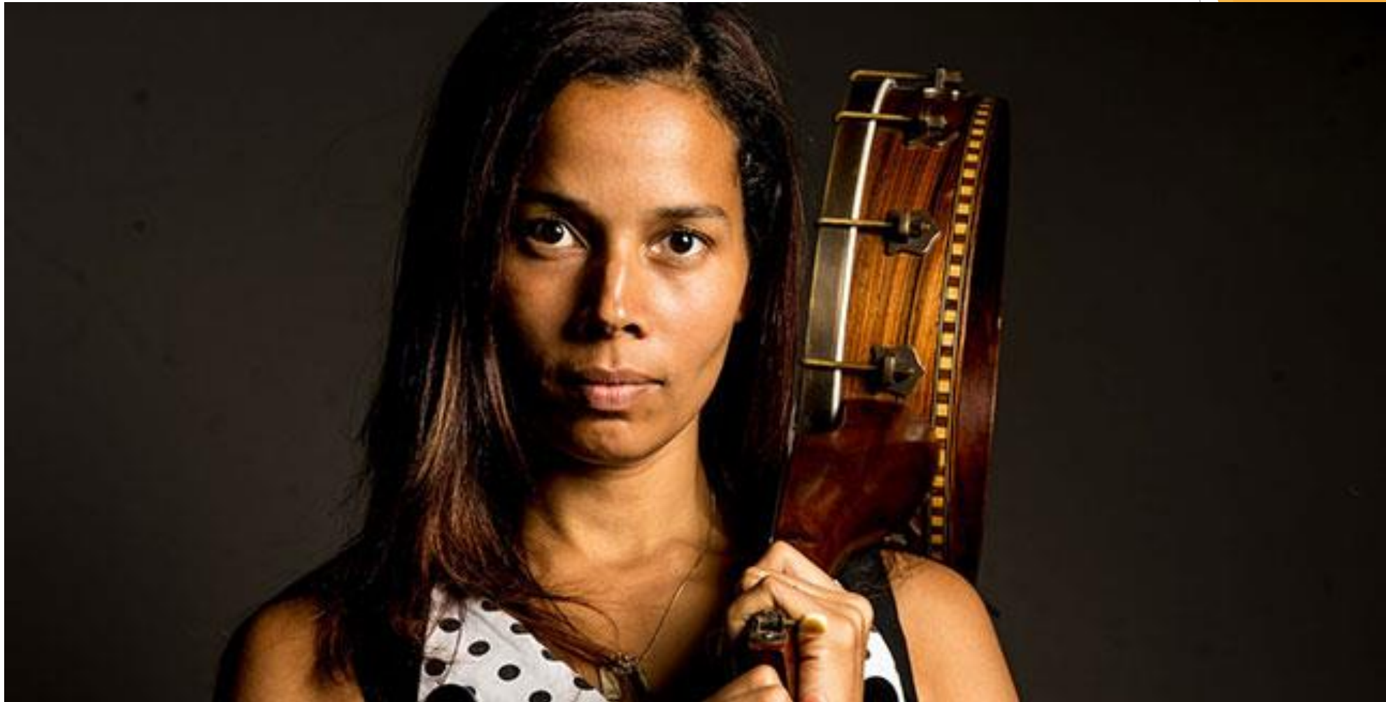
RHIANNON GIDDENS Premiering Omar 2022 at Spoleto USA